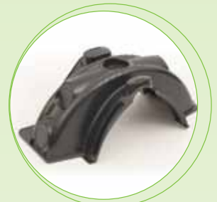
Side Port Coupler