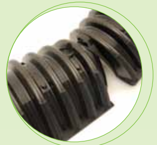
Lock & Drop

ADS Service: ADS representatives are committed to providing you with the answers to all your questions, including specifications, and installation and more.